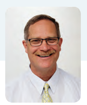
Bring the books...

Finally, what would the CPRC like to say to the RFPA with regard to its future work? We would say that we are not at all upset if the RFPA publishes an extra book or two in a year. That is fine by us. What would trouble us and our translators, however, is if you started to print bland, broadly Evangelical material. Christian book stores and the Internet are already full of such stuff. Instead, keep on publishing rich, comforting, distinctive, Reformed doctrine. Continue sending forth God's pure, biblical, confessional and health-giving truth!